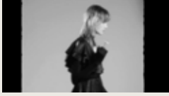
WHODUNIT SASHA LIST 00:01:13