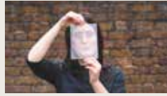
THE DROWNING SHORE HANNAH LOVELL 00:15:00