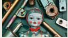
LOVE BYTES: AI-MEE IS HEARTLESS MELODY LEMOON BOSSAN, ETHEREAL GWIRL 00:03:00