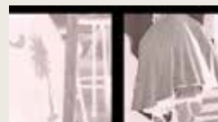
ALL THESE ARID PLACES - CHRONICLE ONE K. S. TEHARA 00:00:56