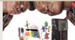
THE CULTS DANI PLOEGER 00:06:11

(UP)LOADED FROM THE CORPORAL TO THE VIRTUAL INTRO BY ALEX MURRAY LESLIE