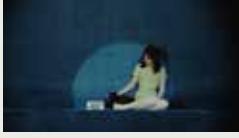
EMILIA AND THE CAT SIMONE STEFANO, POZZI YANG 00:02:00