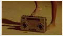
RED CASSETTE VICTOR BASTIDAS 00:14:42