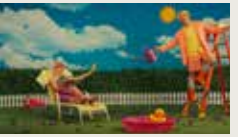
ARTIFICE KATE HARPOOTLIAN 00:06:26