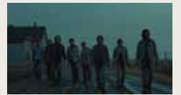
POINT ZERO STEVEN MILLS 00:03:03