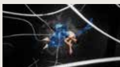
HUMAN TOUCH POEM NO 1 JULIET SEGER, CHRISTINA ALBRECHT 00:05:42