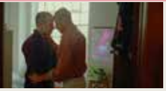
WITH & WITHOUT CHANTAL GOLD 00:03:34