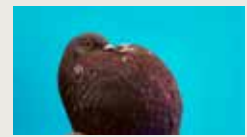
WHEN DOVES TRY THALIA DE JONG 00:02:32