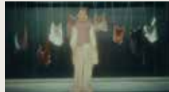
SHIMBALAIE MATTEO FRASCA 00:05:11