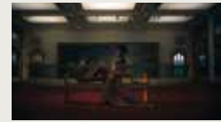
UNDER THE SKIN OF A GUILD: WAKE OF LOST SOULS FREDDIE LEYDEN 00:04:10