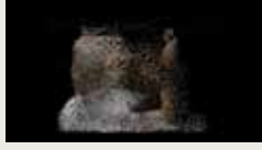
ASTERISK'S ODYSSEY YILIN DU, KE PENG 00:02:00