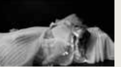
SWIM PETER SPANJER 00:08:02