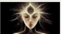
THE CREATIVE MACHINE NINGXIN ZHANG 00:02:55