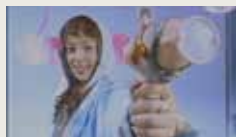
BLASTER YANGYANG WU HUMANI 00:03:11