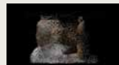
GREEN DEAL ROM DZIADKIEWICZ UKRAINATV 00:08:00