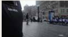
CAPTURE THE BAG WARREN COLE ACKERMAN 00:01:24