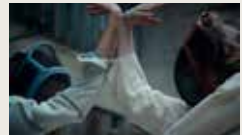
DECHAMPS "EN GARDE" SS25 COLLECTION FILM LUCAS BECCARO 00:03:48