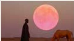
STILLNESS NORA HASE 00:01:30