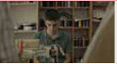
CIRCLE FERHAT ERTAN 00:09:38