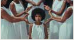
THE RIVER HERRANA ADDISU 00:17:33