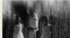
PARADISE CHILD 00:04:11