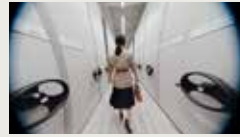
PRADA SS25 JIA LING JOHN MURD 00:00:40