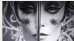
DARK NIGHT OF THE SOUL MARK MULLINS, MALCOLM DOHERTY 00:03:42