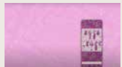
WHY BUY? IS SOCIAL MEDIA MAKING US SHOP MORE? CODY O'CONNOR 00:13:07