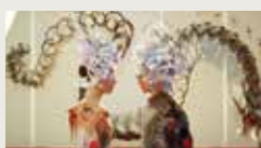
FORBIDDEN REVERIE YISONG HUANG 00:04:00

Since the 2000s, Chinese fashion has flourished, driven by domestic brands and personal style exploration. Fashion evolves rapidly, propelled by social media and a youthful demographic. Emerging designers highlight innovation. Film captures this cultural explosion, offering a complex, creative view of Chinese fashion's dynamic world, where tradition meets modernity.