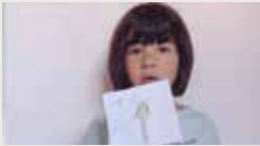
LOVING KINDNESS FOR EARTH SOA 00:00:31