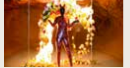
RUNWAY.EXE PETRA 00:02:16