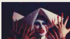
SEE YOU IN SODOM LANE HEATHERINGTON 00:16:10