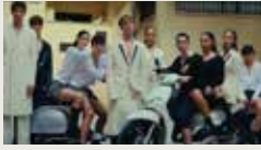
CASERTA ROYAL MICHEL HADDI 00:02:57