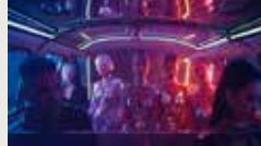
RAGE MONEY POWER DAVID KYUNG-MIN SHELDRIK 00:01:17