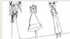
FUTURE STARTS TODAY BIANCA PAKUSEVSKIJ 00:00:30