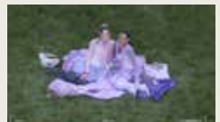
THE GRIP OF FEAR ALENA PLOSKI, GUILLAUME JOLLY 00:04:38