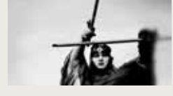
ÜBERMENSCH (OVERMAN) TIM YIP 00:03:11