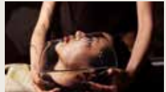
GENUINE PLACES YUNPENG WANG 00:01:00