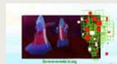
BLOMSTRA I TROLLHÄTTAN SÁLSSI JENNIFER-ANNELIE 00:04:12