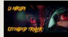
LA MIRANDA TRAILER MATT WILLIS-JONES 00:03:30