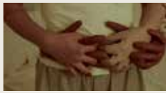
STRINGS OF ATTACHMENT GIEUN CHAE 00:02:08