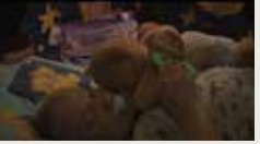
HAPPY HAPPY BABY JAN SOLDAT 00:20:00